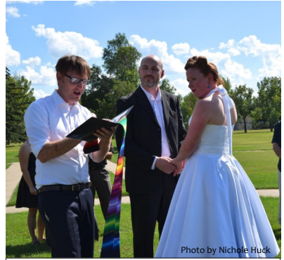
Outdoor service in Wascana Park

Knox-Met's minister will meet with you and build a service that is full of joy and meaning. Your distinctive and unique ideas are welcome here.