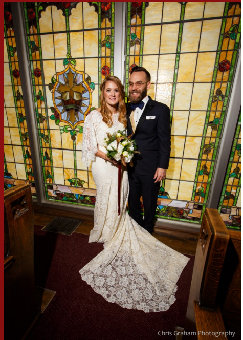
Chris Graham Photography

...from here we will work with you directly to make your wedding ceremony memorable, full of love and run as smoothly as possible.